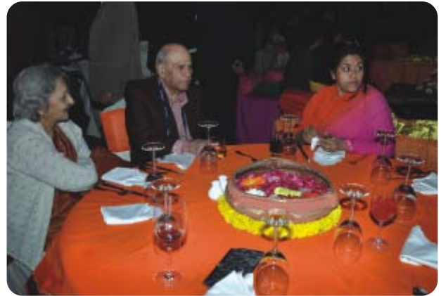
Gala Dinner at Hotel Imperial