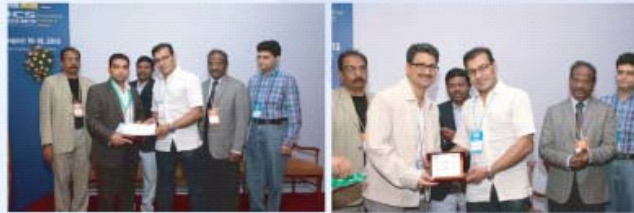
Poster Presentation Award