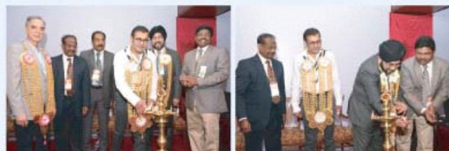
Inaugural Function – Our Honourable President & Secretary – traditional lightening.