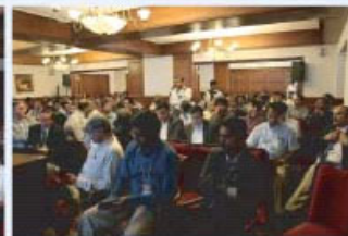
Faculty and Delegates in interactive sessions